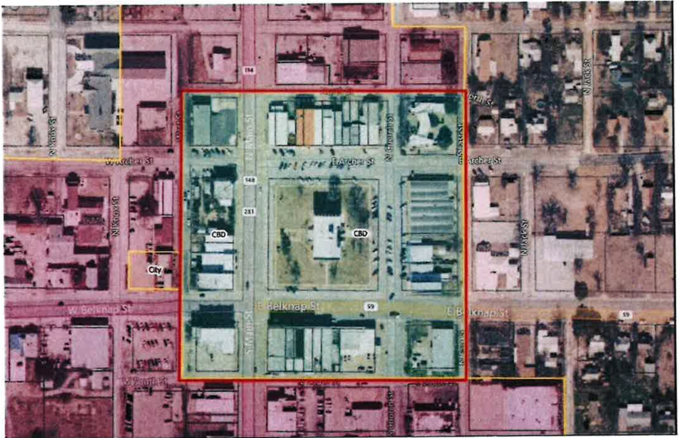
TAX ABATEMENT ZONE #4; CBD ZONING DISTRICT OF THE CITY OF JACKSBORO

_____ BOUNDARY LINE OF TAX ABATEMENT ZONE #4